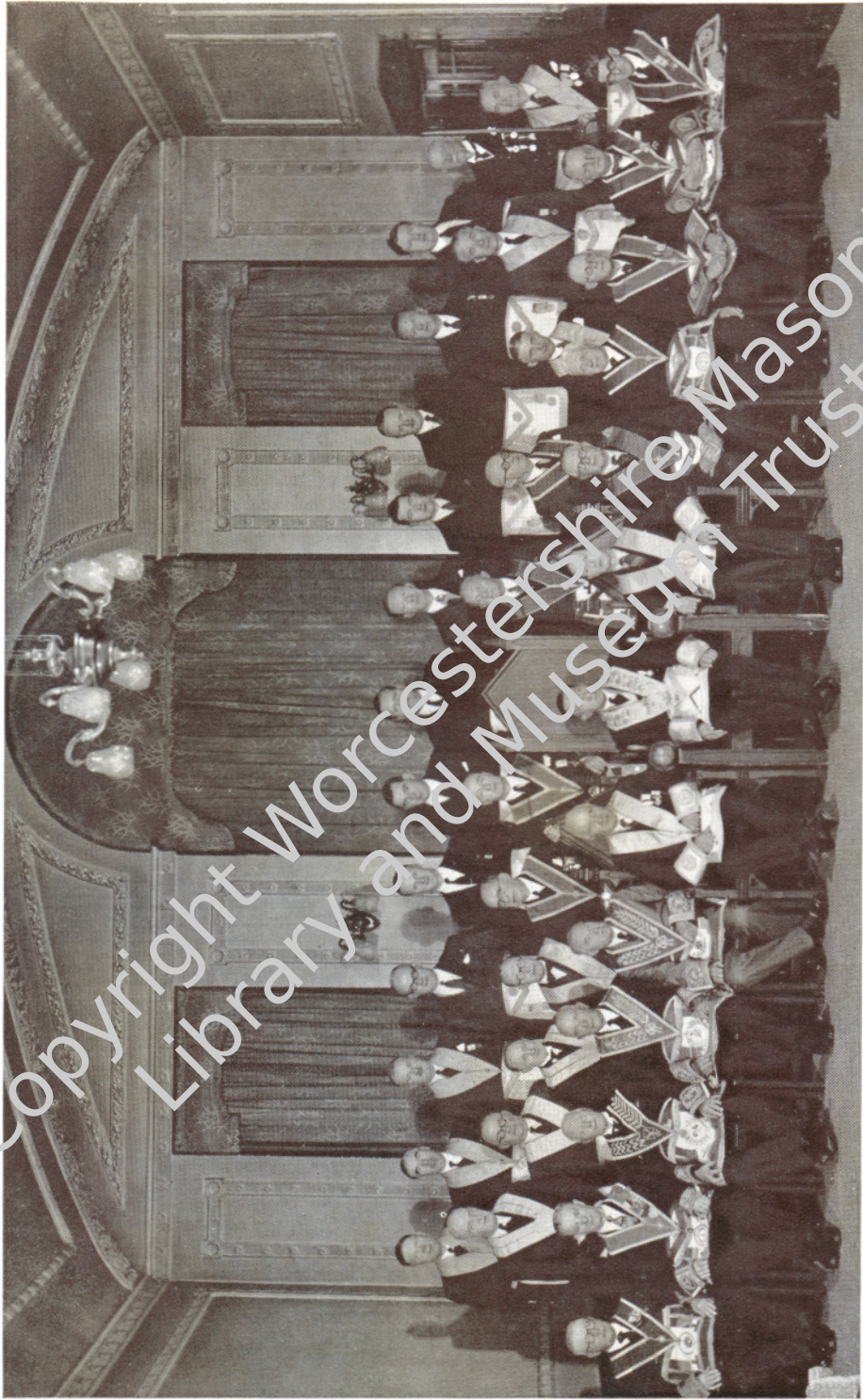
MEMBERS, May 28th. 1949