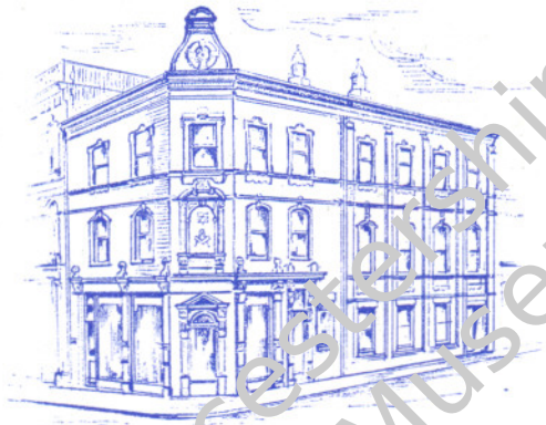
The old Masonic Hall, St. Nicholas Street, Worcester, dedicated on 10th August, 1891, under the banners of Worcester Lodge No. 288 and Semper Fidelis Lodge, No. 529.

The last ceremony in this hall was held on 20th May, 1959