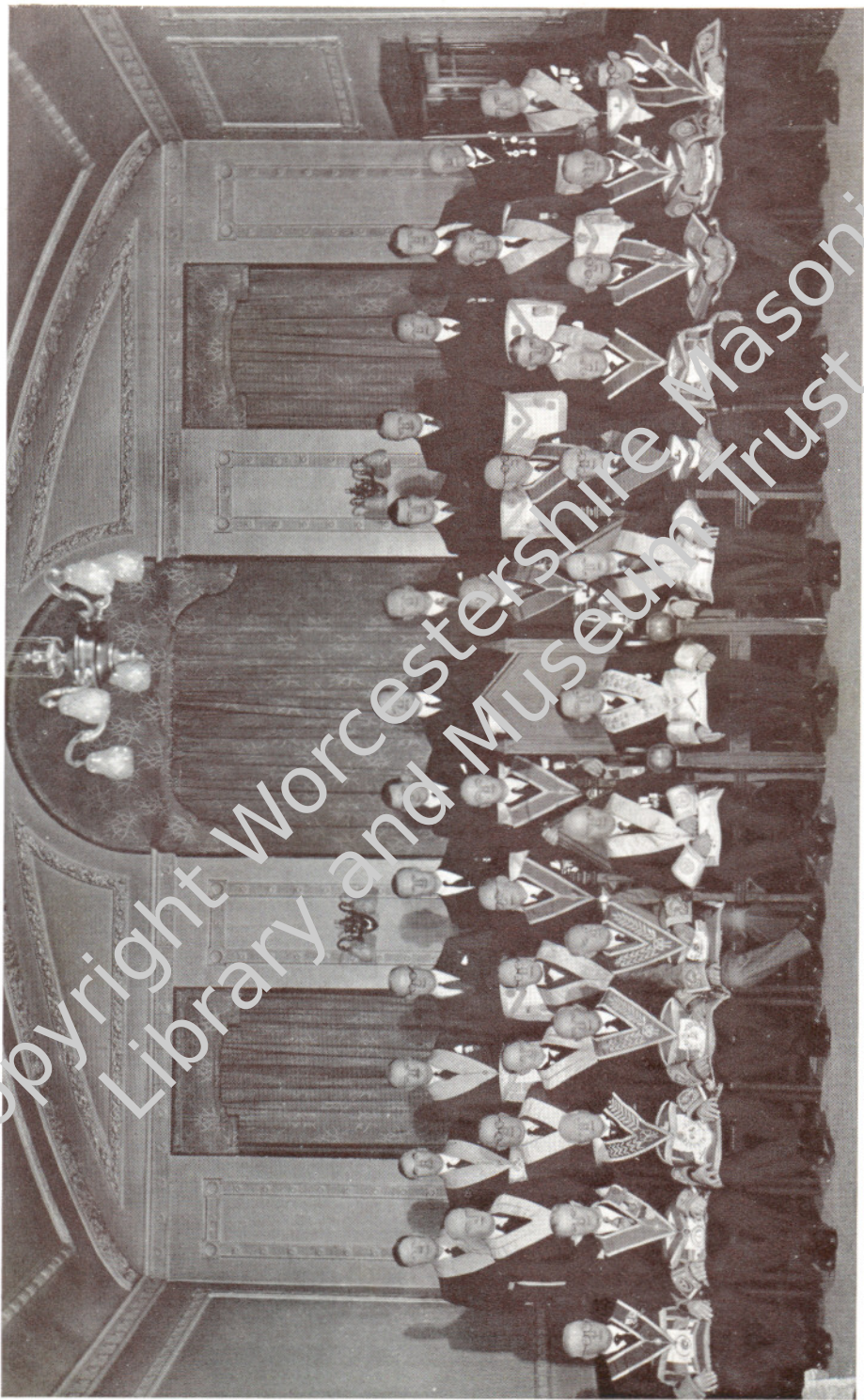
MEMBERS, May 28th. 1949