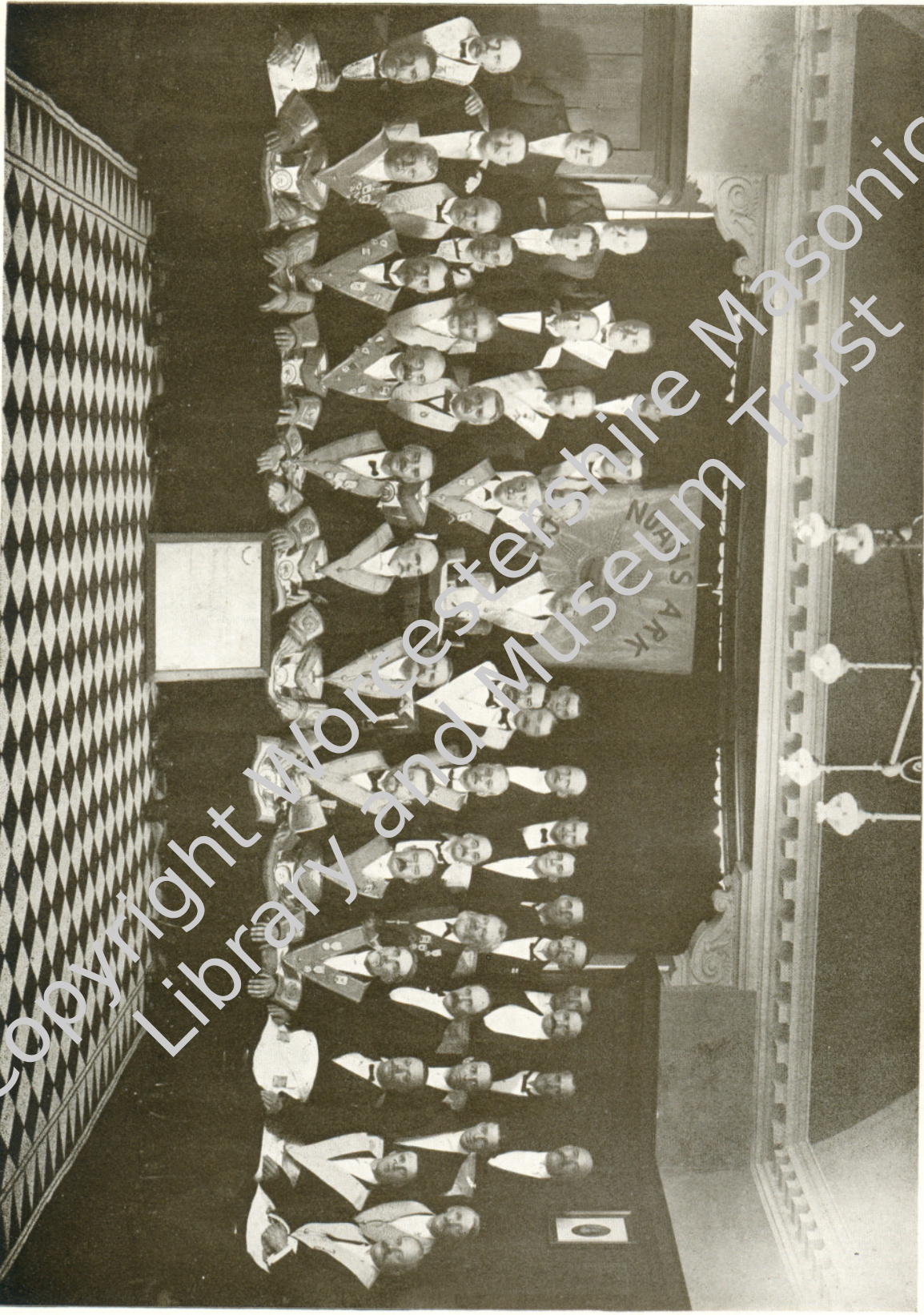
PRESENT MEMBERS OF NOAH'S ARK LODGE, No. 347.