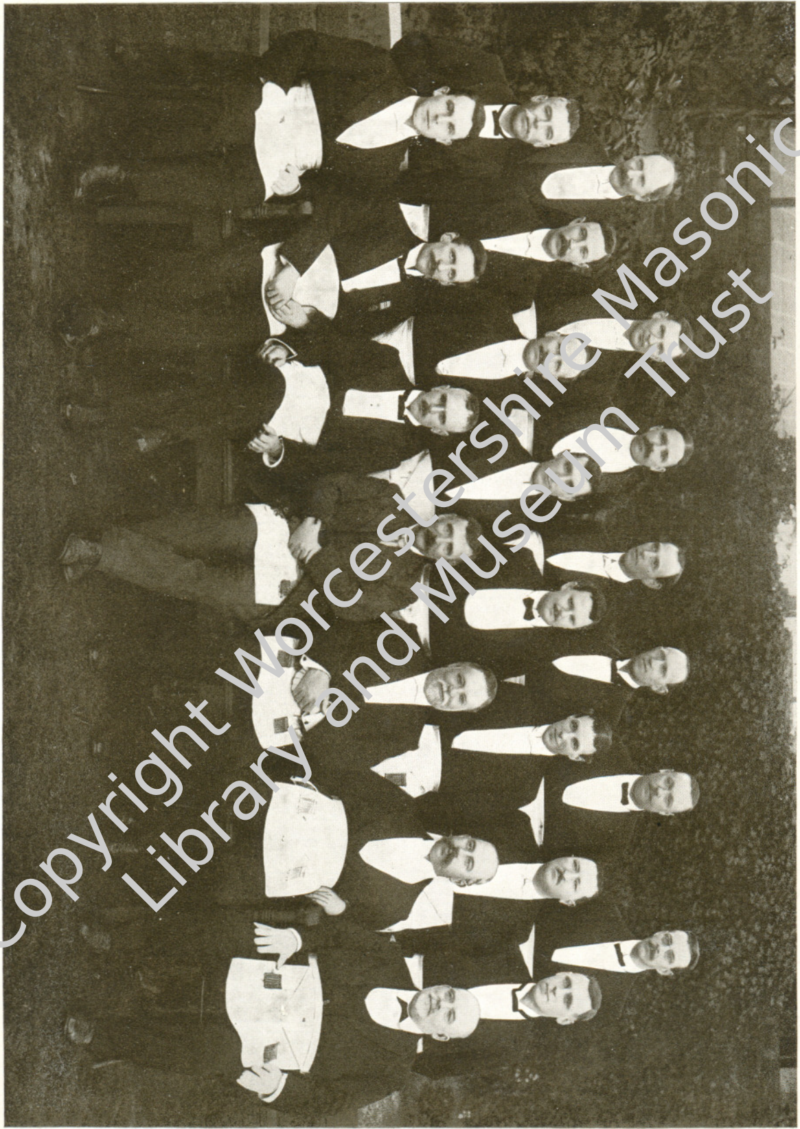
PRESENT MEMBERS OF NOAH'S ARK LODGE, No. 347. NOT IN OFFICE.