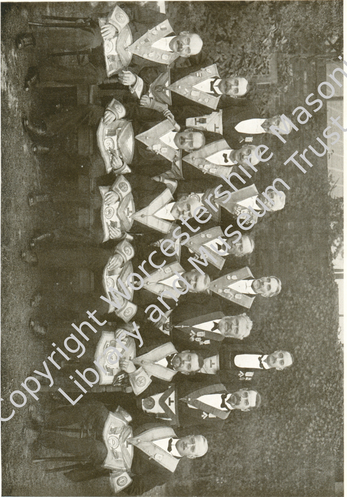
PRESENT PAST MASTERS OF NOAH'S ARK LODGE, No. 347.