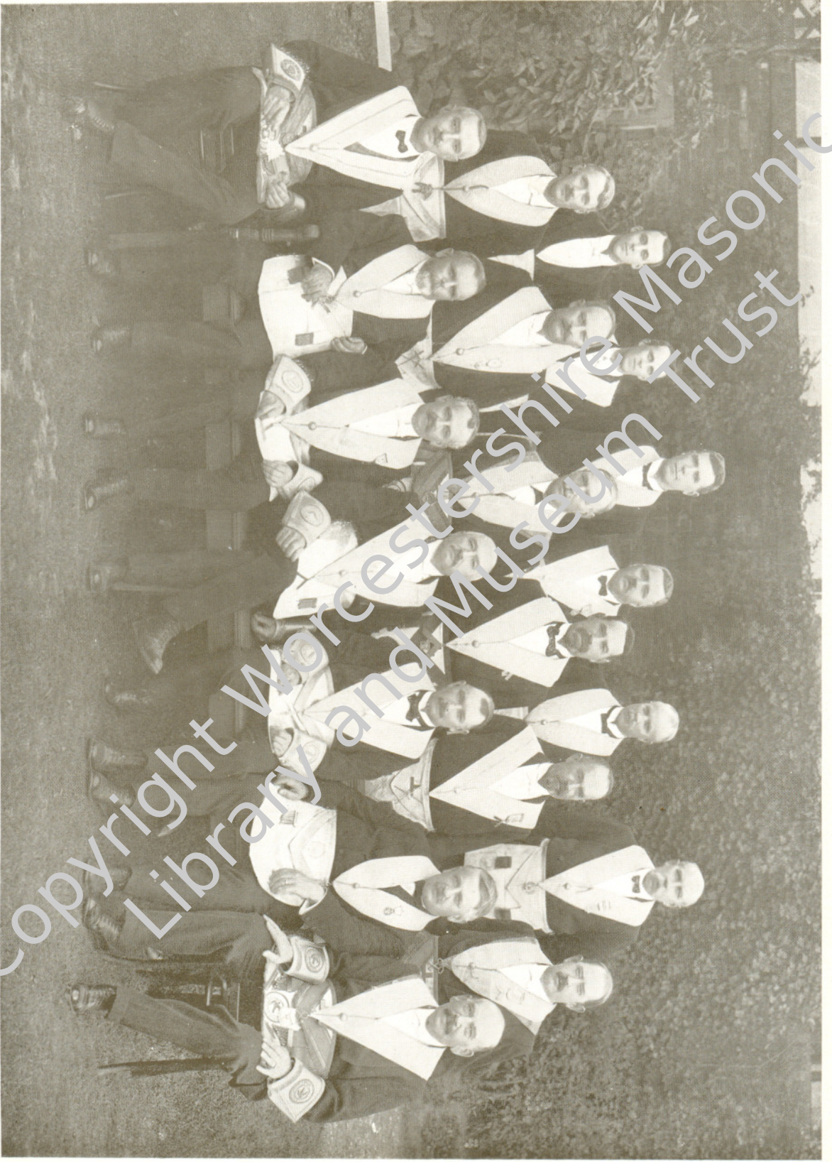
CENTENARY OFFICERS, 1915